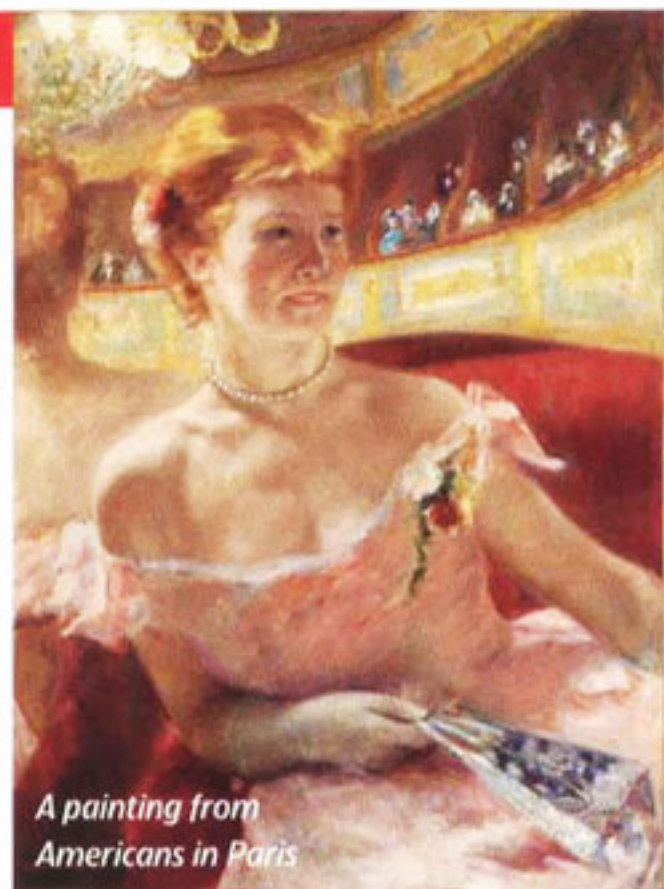
A painting from Americans in Paris