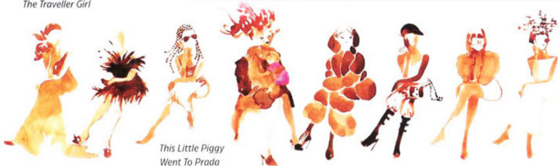
This Little Piggy Went To Prada