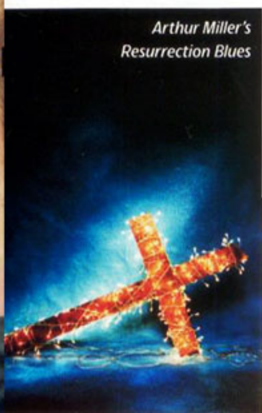
Arthur Miller's Resurrection Blues