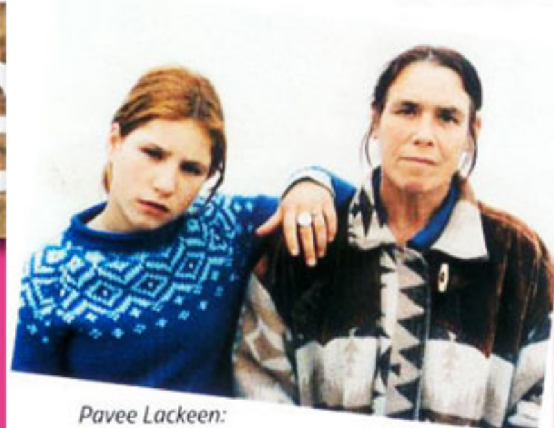
Pavee Lackeen: The Traveller Girl

The only book you ever really need to read is Peter Boxall's 1001 Books You Must Read Before You Die (Cassell, £20). It's like a library in your pocket – dip into it and feel smugly well informed.